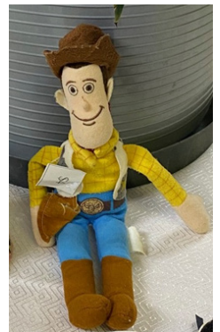
A gift for a fortunate fan or parent?