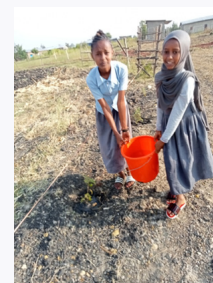
Right: Tree planting - environmental education (Ethiopia)