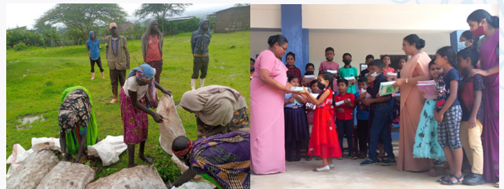
165 Gumuz families in Galya Rogda, Ethiopia benefitted from famine relief as crops failed due to the ongoing drought and inability to access water. Thank you donors.