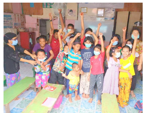
Burmese migrant children in Thailand continue to benefit from text book funds provided by the Committee