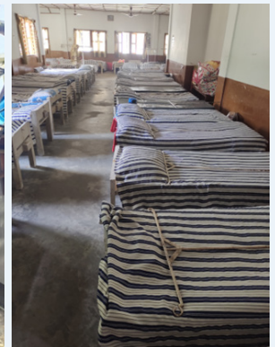
Right: Beds and bedding for poor tribal girls at Jollang.