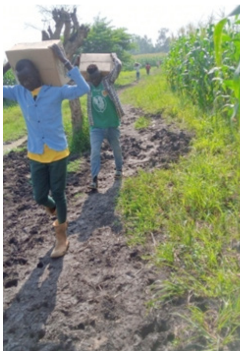
Access to education is not so easy for the Gumuz people of Galiya Rogda. Here locals trudge through the mud transporting educational materials.