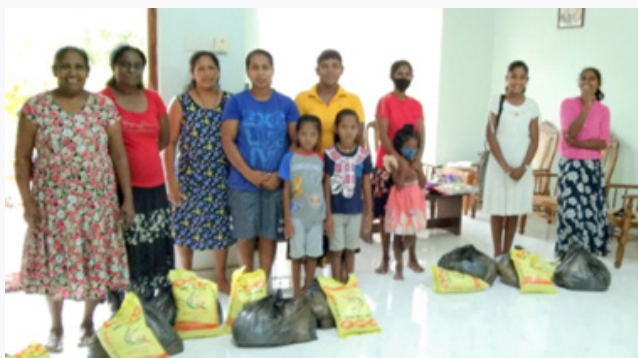
One of several community groups benefitting from Committee assistance during the economic crisis in Sri Lanka (Siri Nidhan -New Beginnings Program)

Ethiopia and Sri Lanka were especially affected by the natural and manmade disasters of 2022. The deprivations of many poor communities increased, with many suffering malnutrition and hunger. Thanks to media coverage, kind-hearted donors and shop workers, the Committee was able to respond and provide emergency financial help to several of its affected centres.