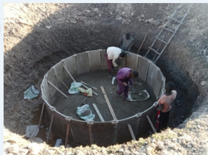
Left: Rainwater tank Goro, Ethiopia