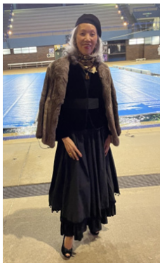
A satisfied customer (above) shared her photo wearing a fur coat purchased from Committee shop.