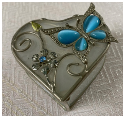
Another hidden treasure!