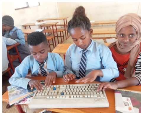
At Bethany Little Flower School, Goro, Ethiopia, younger classes receive an introduction to computers.