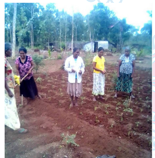
A Community Garden will help young mothers to earn an income (Sri Lanka)