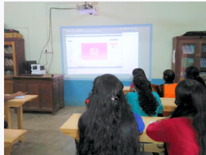
Students at St Mary's Mariapuram, Trivandrum, India, enjoy their new technology thanks to Committee's donors