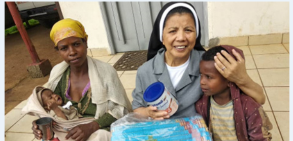
Appeal for baby formula and adequate food for malnourished mothers and infants, Gagure Bora, Ethiopia