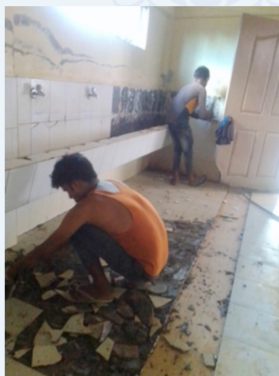
Construction of bathroom facilities for 100 poor vocational students at Troncatti Home, India