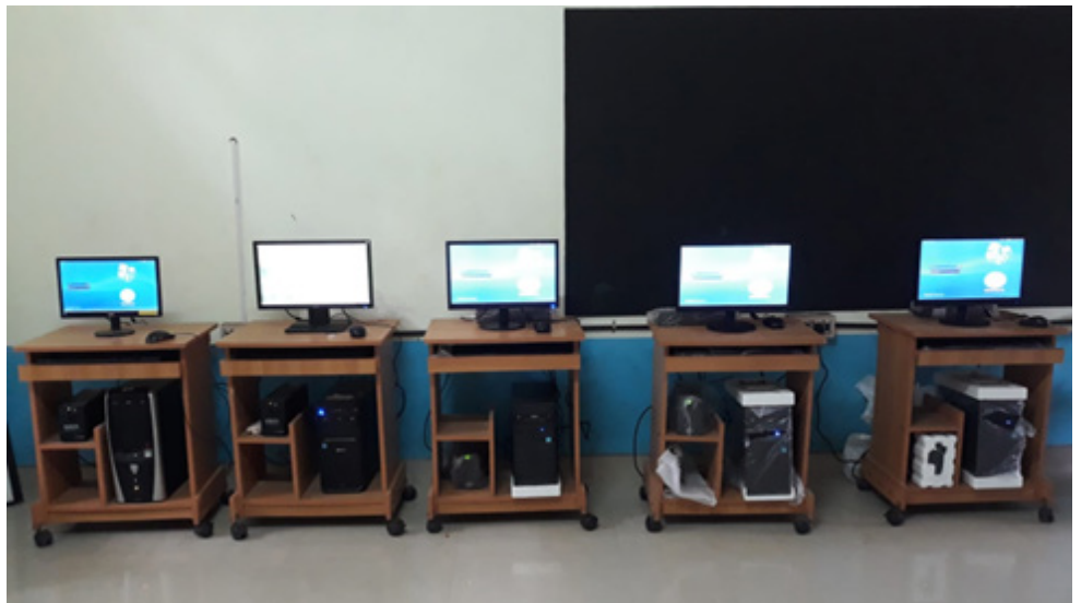
Essential technology for St Mary's Mariapuram High, Neyyattinkara Diocese, India, purchased with Committee funds