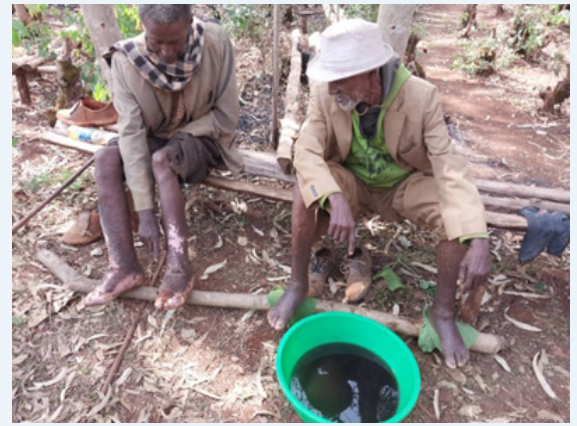
Ongoing support for podoconiosis sufferers in Ethiopia

The current cohort of seventy disabled children and youth attending Bethany Jeevan Jyothy Special School are taught job-orientated skills including computer data entry and the production of joss sticks. With growing student numbers after Covid lockdowns, the school sought funds for the purchase of an income-generating 'plate-making machine' to enable the students to use areca nut plant leaves to produce plates which are in high demand.