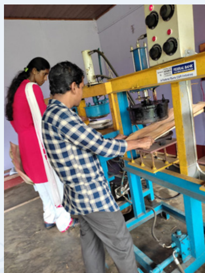
Jeevan Jyothy students learn vocational skills