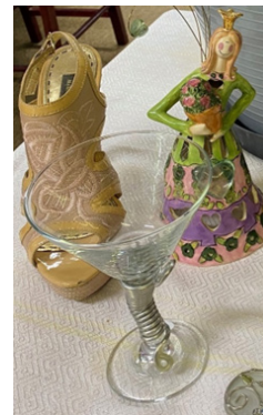
You may be surprised what can be found!