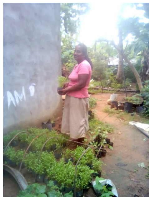
Horticultural advice, financial support and supplies should secure future independence