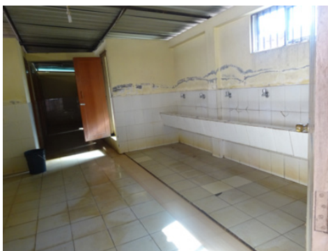
New bathroom facilities almost completed, Troncatti Home, India. Thank you donors!