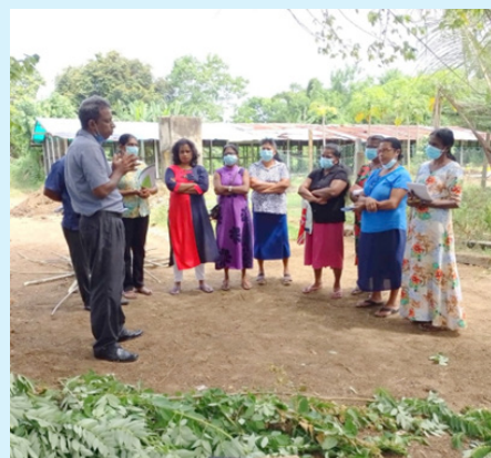
Widows and disadvantaged women gain horticultural and small business skills SRI LANKA