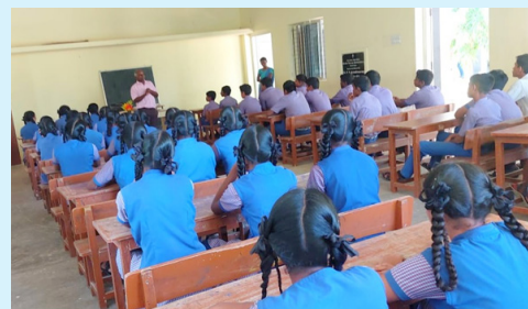
Student sponsorship assistance Mother Theresa School INDIA