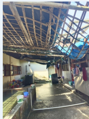
Left: Building repairs for Girls' Home, Salesians, Jollang Centre