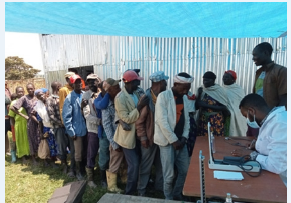
The long queues at the medical camp at Galiya Rogda bear witness to the need for health support