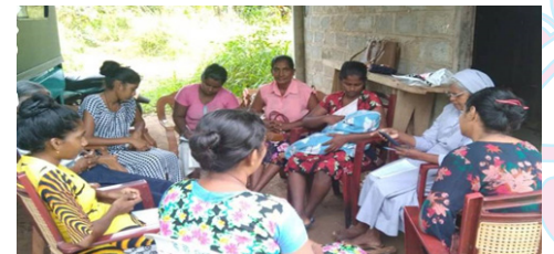
Learning new skills to empower disadvantaged mothers

The Sisters have organised motivational and income-generating programs for poor women who are eligible for financial loans to be repaid over time, allowing other women to benefit in the future.