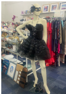
A worthwhile purchase for that special party!