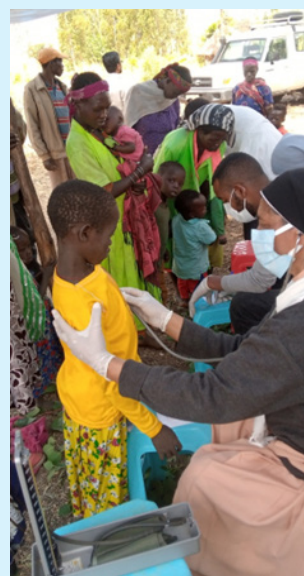
Medical and developmental assistance to underprivileged Gumuz people ETHIOPIA